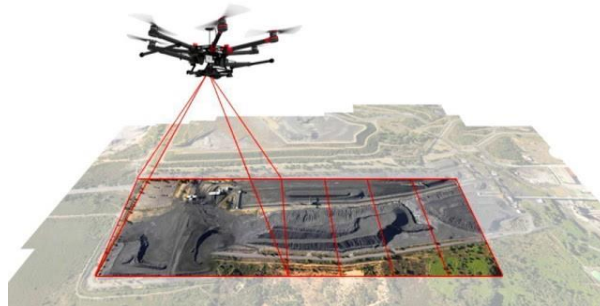
Figure 1. The use of optical scanners on an unmanned aerial vehicle (UAV)

The use of UAVs has proved most effective at areal sites where a large amount of excavation work takes place. The construction control engineer can provide up-to-date information on the actual earthworks performed on a daily basis.