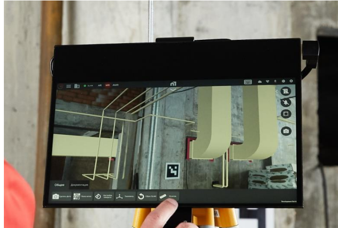
Figure 2. The BRIO MRS tablet

The BRIO MRS tablet is effective for complex engineering objects with a large intersection of communications